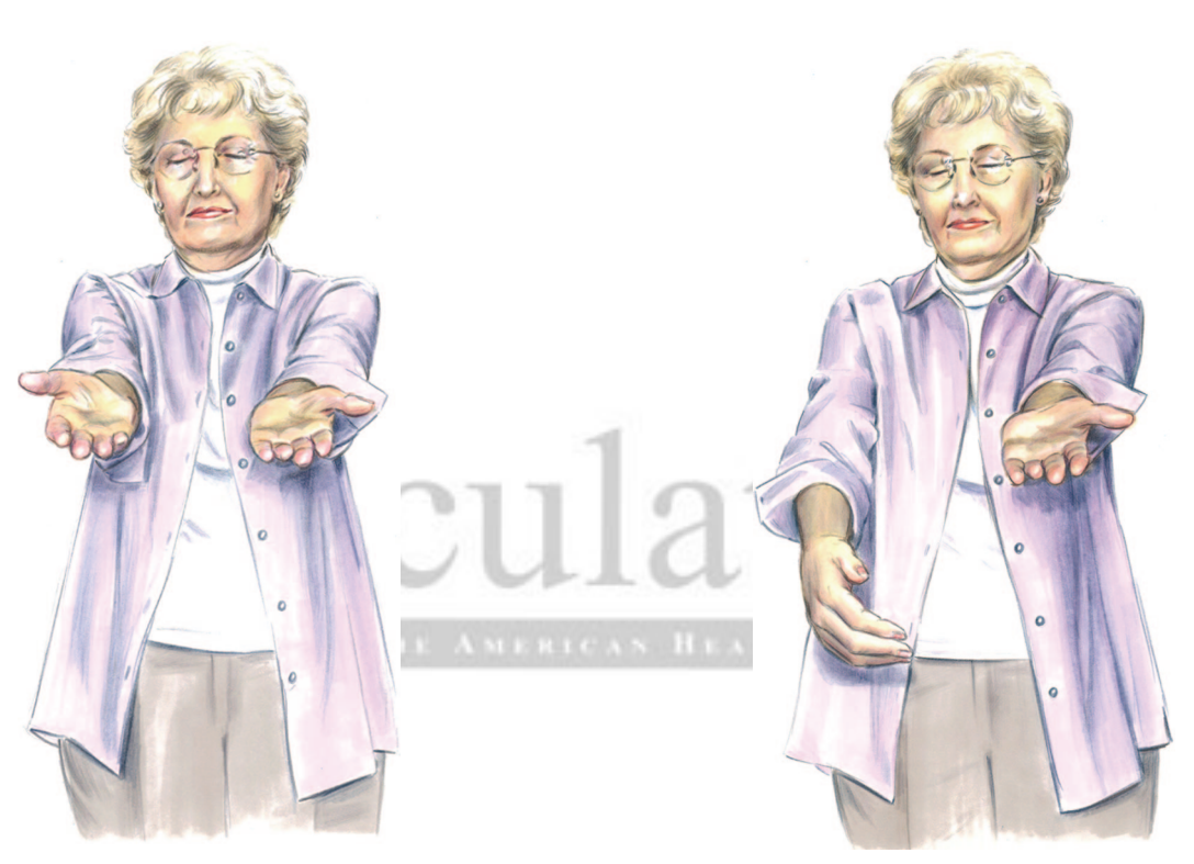
One-sided motor weakness (right arm).